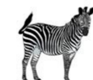
Zebra - whinny