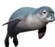
Seals - bark