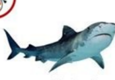
Shark - whinny