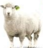
Sheep - baa