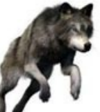
Wolves - yell