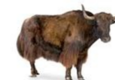
Vale - grunt